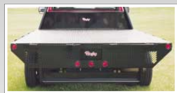
Clearance lights are recessed flushed with rub rail