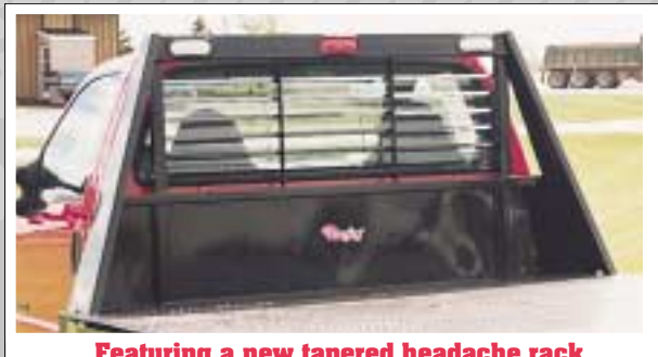
Featuring a new tapered headache rack